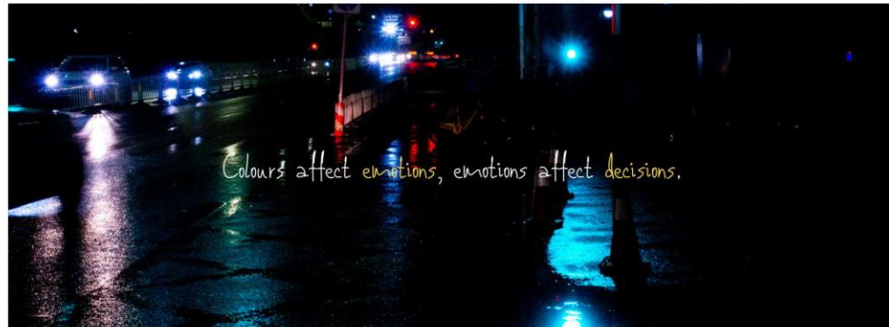
The 2000s (the city of Glasgow in Scotland) - changes the color of some streetlights from yellow to blue --> number of crimes decrease 2005 (Nara a city in Japan) - installed blue lights onto train platforms --> number of suicides decrease blue lights: clams / cop cars